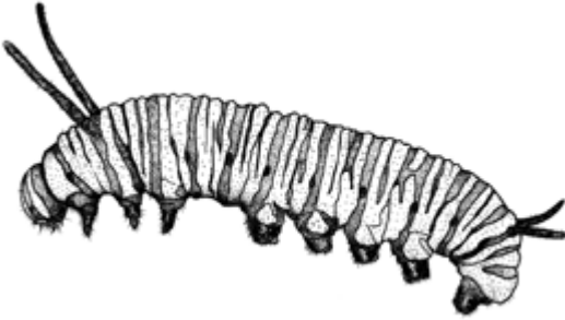
This drawing is actually 5 times larger than the real caterpillar.

First measure this monarch caterpillar using a centimeter ruler. _____ centimeters Measure only the body. Do not include the tentacles. Then measure it using an inch ruler. _____ inches